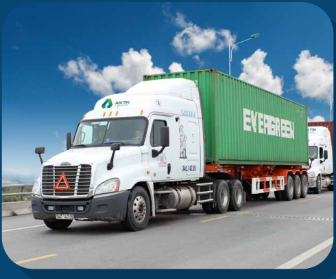
Transportation (Domestic and International)